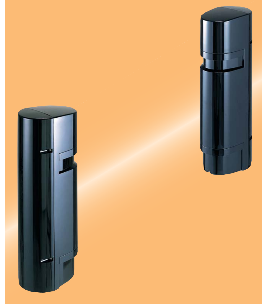
Patent registered(No. 1766439) Utility model registered:2 Utility model pending:3 Design registered:1

"ANTI-CRAWL" HIGH SECURITY PHOTOBEAM C€ ♥ N1702 PB-IN-100AT:Outdoor 100m (330 ft.)